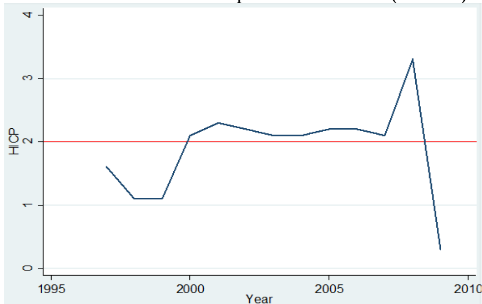
Figure 1. Harmonized index of consumer prices in the Eurozone (1996-2009)

Source: HICP — inflation rate, annual average rate of change Eurostat.